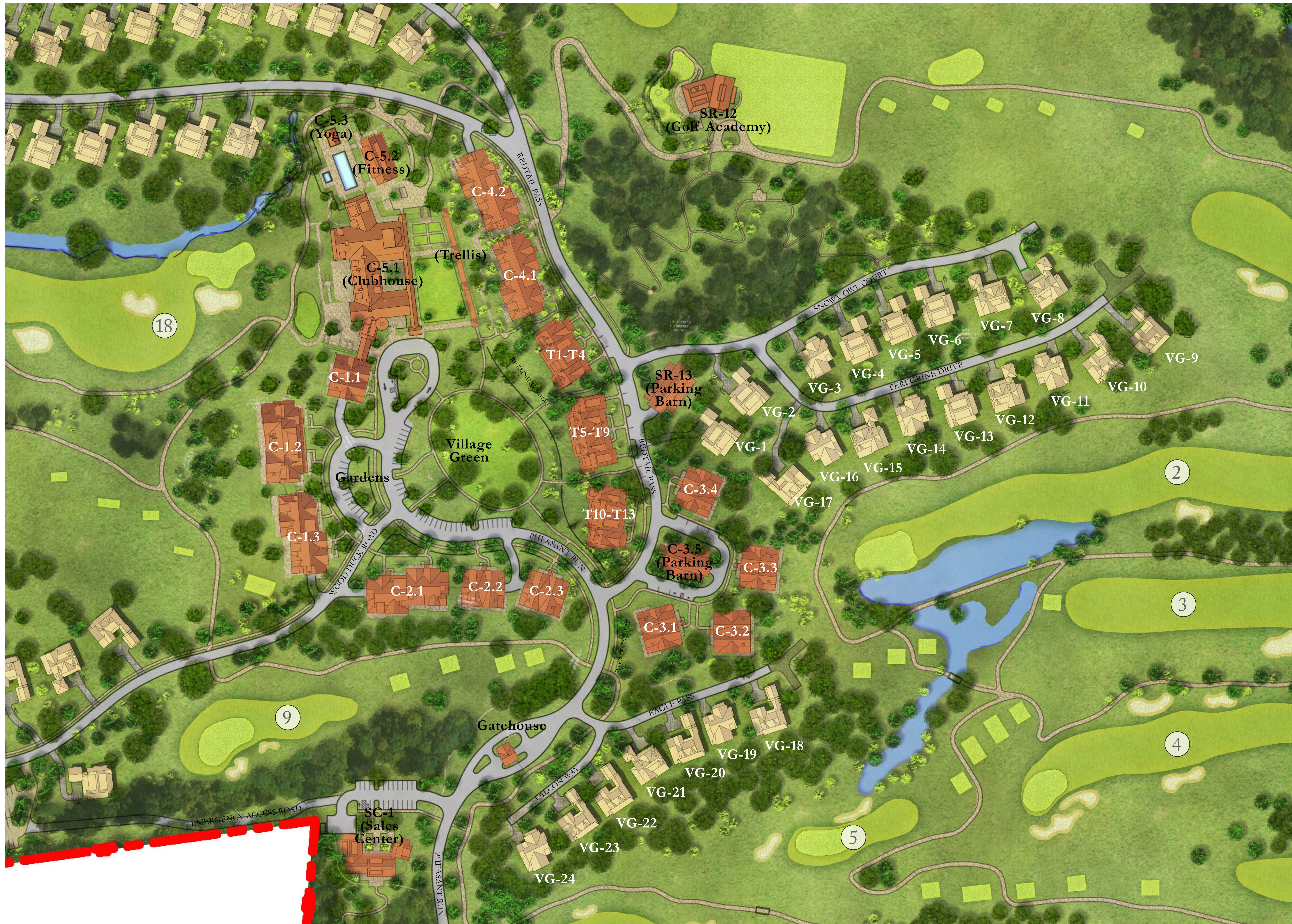
SITE PLAN - VILLAGE GREEN